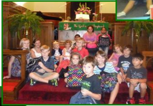
Blessing of the Backpacks