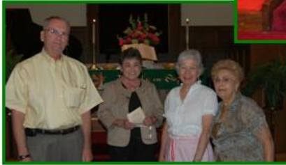
Commissioning of Sunday School Teachers