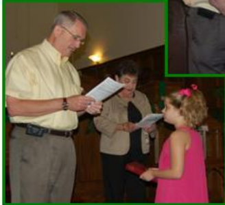
Third Graders Receive Bibles